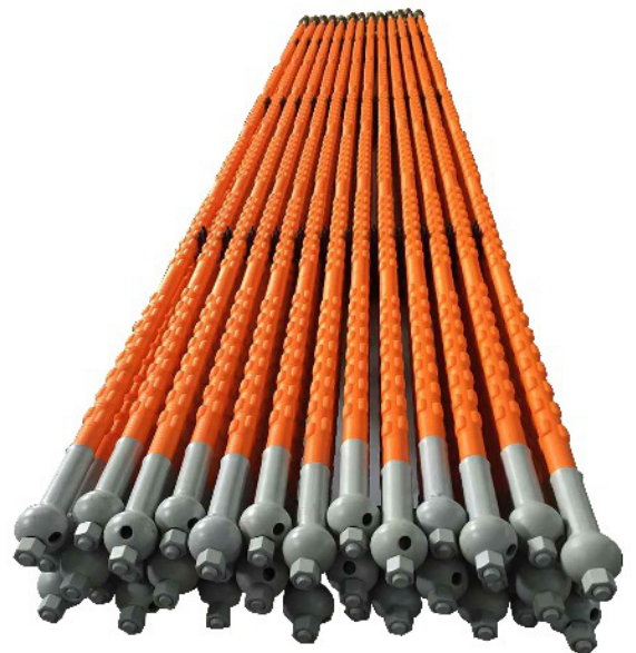
NC-Bolts packed on pallet.