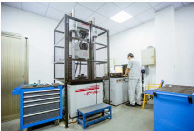
Pretec China laboratory