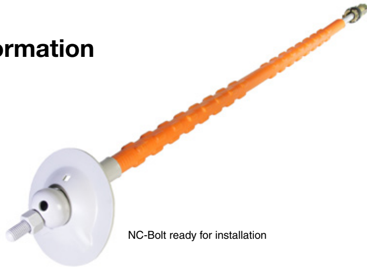
NC-Bolt ready for installation