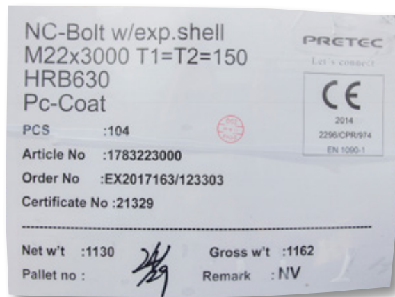
Standard label marked with certificate number

Certificates in compliance with EN 10204 3.1 are available for inspection. Approvals for bolts from the Norwegian Public Road Administration and Bane NOR (Norwegian Railway Authority) for use in Norwegian infrastructure tunnels are available on request.