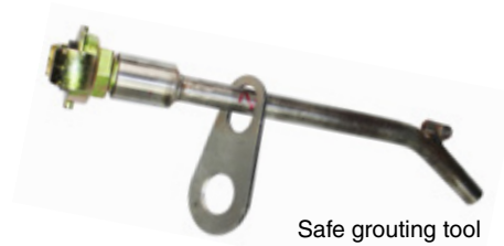
Safe grouting tool

Please refer to product technical data sheet for Pc-Coat and relevant management, operations and maintenance documentation and Pc-Coat brochure which may be downloaded at: www.pretec.no