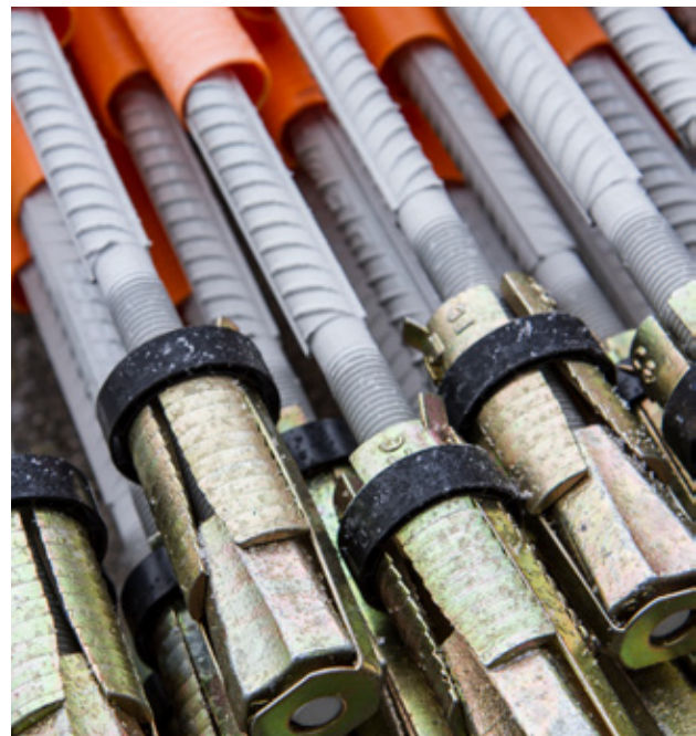
Nc-bolts with mounted expansion shells