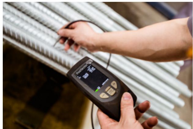
Control of coating thickness