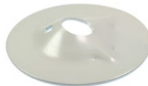
Spherical bearing plate